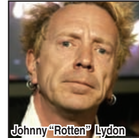
Johnny "Rotten" Lydon