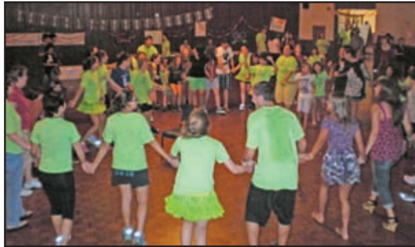
Campers, staff, and community members do a well-known dance – the hora.